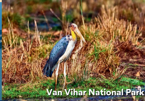
Van Vihar National Park